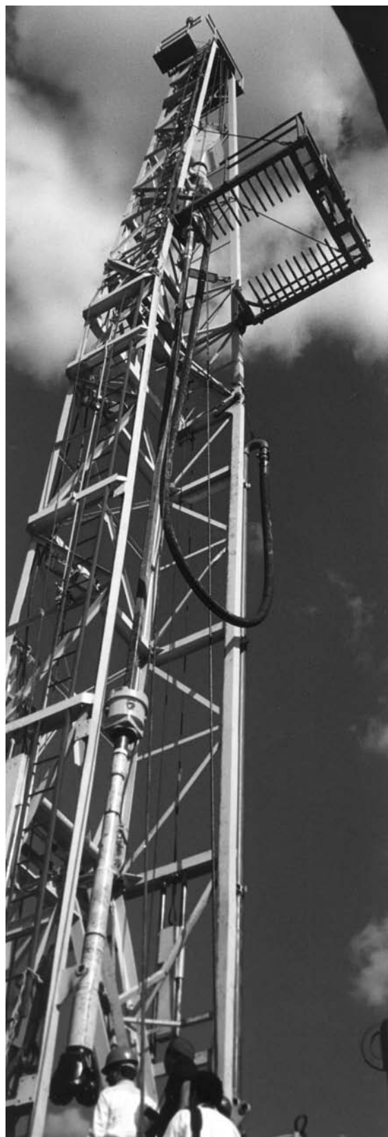
Fig. 2b. The CSDP rig at Hacienda Yaxcopoil.

has been proposed in Dressler et al. (2003) and in other papers included in these volumes (e.g., Tuchscherer et al. 2004; Stöffler et al. 2004). The Cretaceous sedimentary rocks below about 895 m are cut with dikes of polymict breccias and display zones of monomict brecciation. They appear to represent “megablocks” displaced by the impact event. Anhydrite layers, the thickness of which varies from a few centimeters to up to 15 m, and make some 27% of the megablocks. Organic-rich layers and oil-bearing units are present at depths between 1410 and 1455 m (according to Kenkmann et al. [2004], this layer starts at 1263 m.).